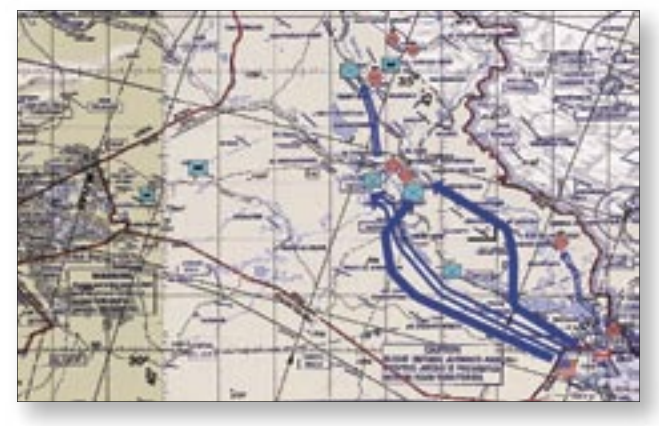
Full 2525B including MOOTW and custom symbolgy, including conventional and non-traditional warfare.